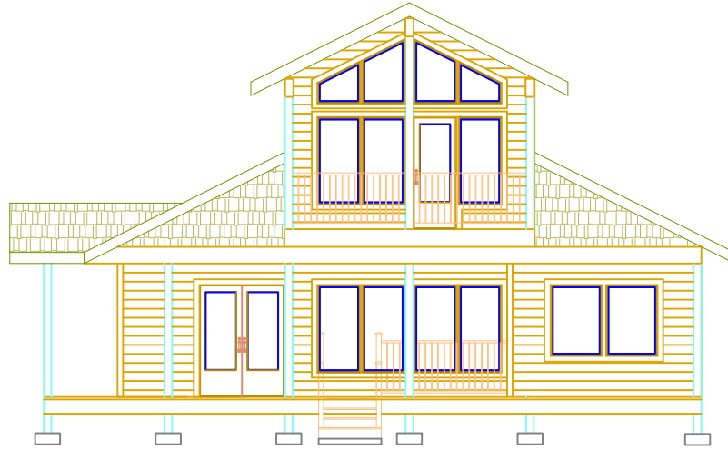
Front Elevation Green River 1864 sq.ft.